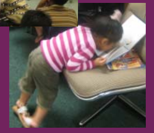
The love of books starts early.