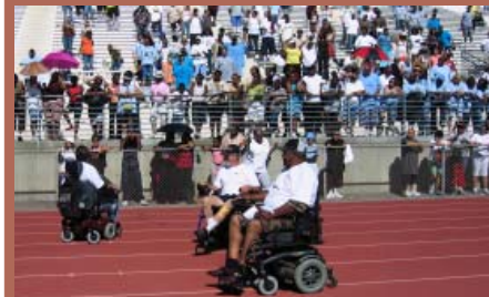
Opening Ceremony and Parade Competition