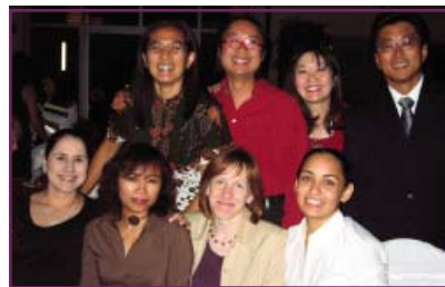
Core Office Contingent