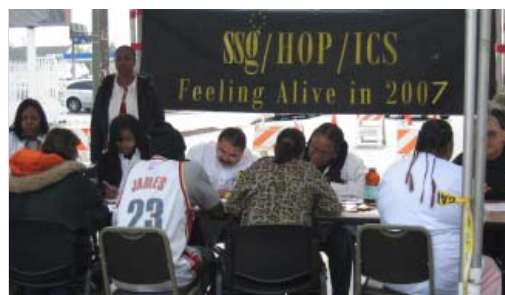
HOP ICS booth