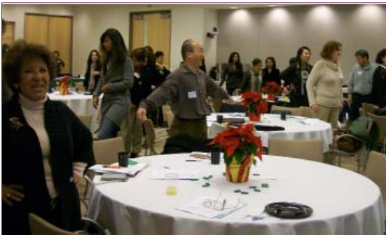
Consultant Appreciation Party during an exercise break